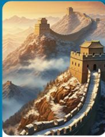
Badaling Great Wall